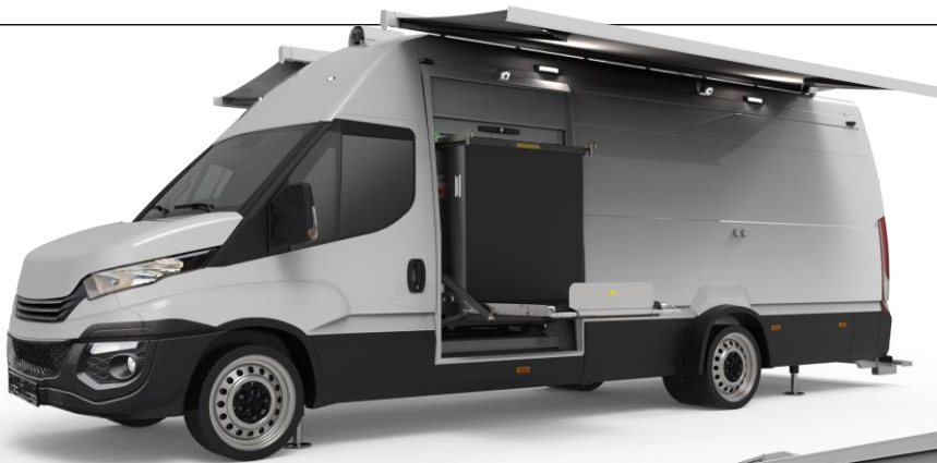
| MXV DV FULLY DEPLOYED |