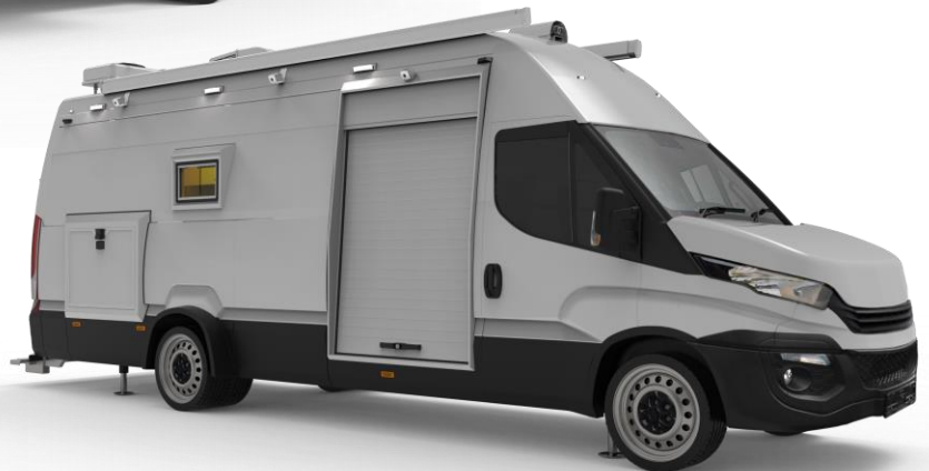
| MXV DV IN TRANSPORT MODE |